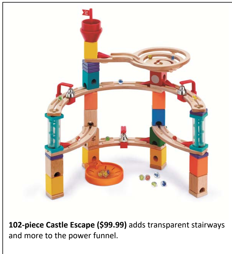
102-piece Castle Escape ($99.99) adds transparent stairways and more to the power funnel.

Award-Winning Quadrilla. This is the famous Marble Run that is bringing more parents into specialty toy stores, looking for Hape toys. Quadrilla rewards thinking and building with great action, while developing STEM skills at the same time. Six new items for age 4 years and up.