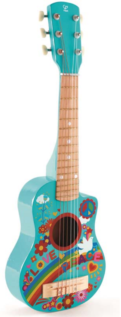
26-inch Flower Power Guitar ($39.99), boasts peace and love graphics and promising some Classic Rock!