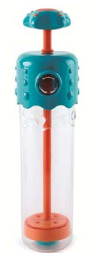
Multi-Spout Sprayer ($9.99) offers four different ways to have fun in the bath. Plus, the sprayer and new squirts unscrew for safe, easy cleaning.

Hape Bath Toys. Turn bath time into giggle time with a collection of sea-themed creatures. Five new items for ages twelve months and older.