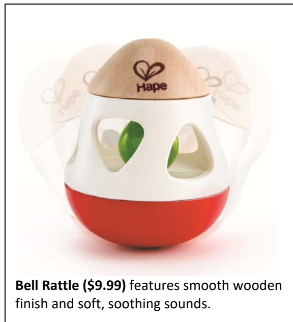
Bell Rattle ($9.99) features smooth wooden finish and soft, soothing sounds.

Hape Baby Toys. As always, Hape leads with toys that help young minds develop and grow in a safe, comforting way. Thirteen new items for newborns and older.