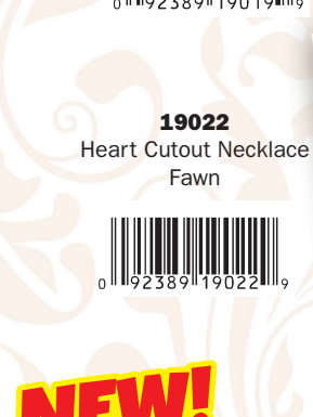
19022 Heart Cutout Necklace Fawn