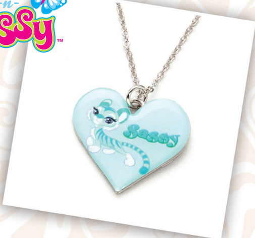
19044 Sweet & Sassy Word Necklace - Tiger