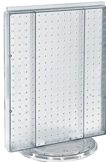
17684 Pegboard Counter Display 2 Sided Clear 12" Base 16"W x 21"H