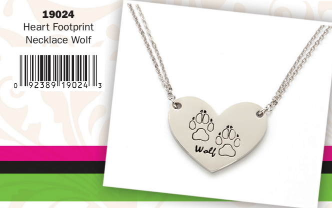
19024 Heart Footprint Necklace Wolf