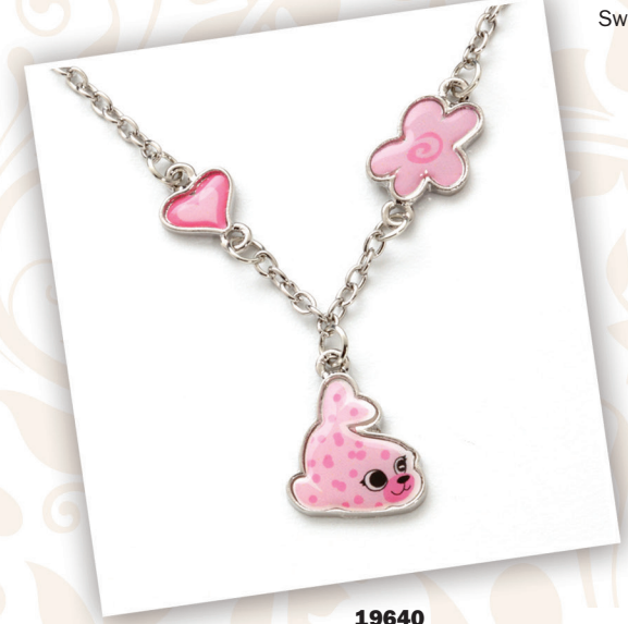
19640 Sweet & Sassy 3 Charm Necklace Harbour Seal