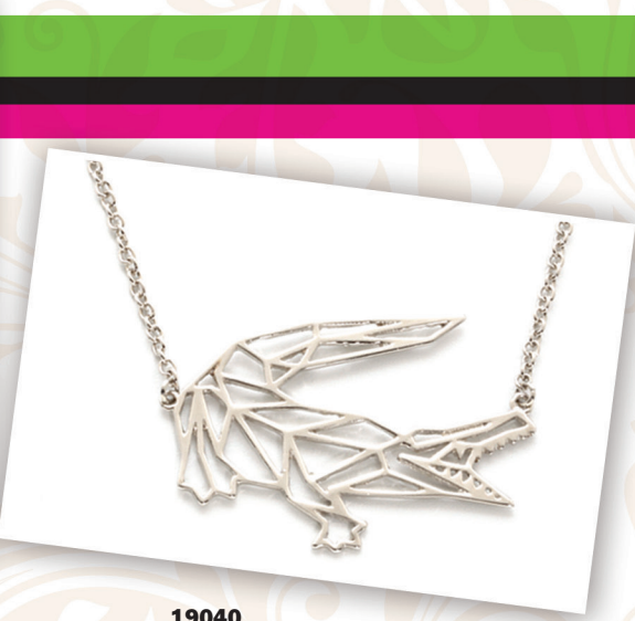
19040 Geo Pendant Necklace Alligator