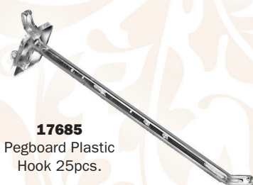
17685 Pegboard Plastic Hook 25pcs.