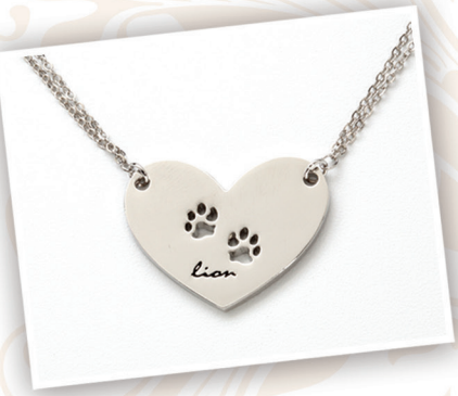
19027 Heart Footprint Necklace Lion