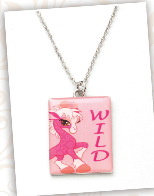
19043 Sweet & Sassy Word Necklace - Giraffe