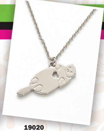
19020 Heart Cutout Necklace Sea Otter