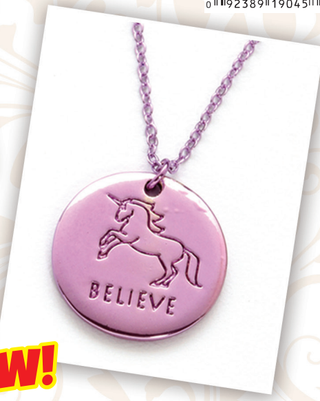
19045 Word Circle Necklace Believe