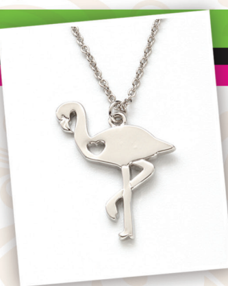
19017 Heart Cutout Necklace Flamingo