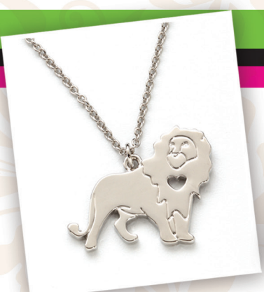
19019 Heart Cutout Necklace Lion