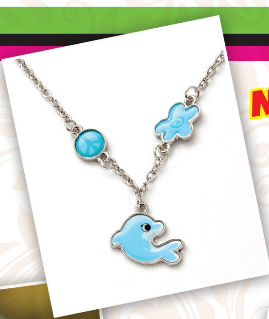
19638 Sweet & Sassy 3 Charm Necklace Dolphin