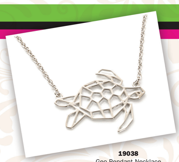
19038 Geo Pendant Necklace Sea Turtle