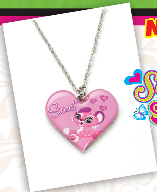
19042 Sweet & Sassy Word Necklace - Cheetah