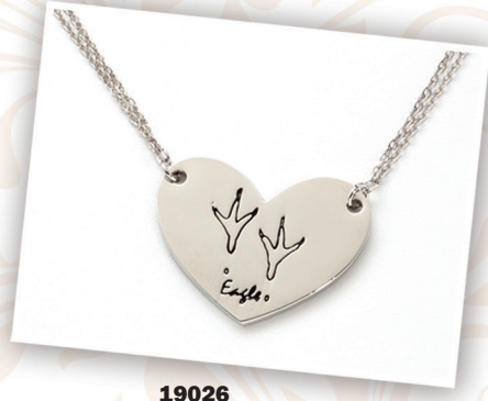
19026 Heart Footprint Necklace Eagle