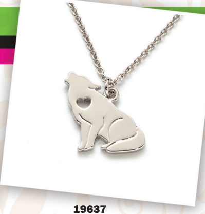
19637 Heart Cutout Necklace Wolf