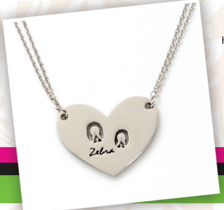
19666 Heart Footprint Necklace Zebra