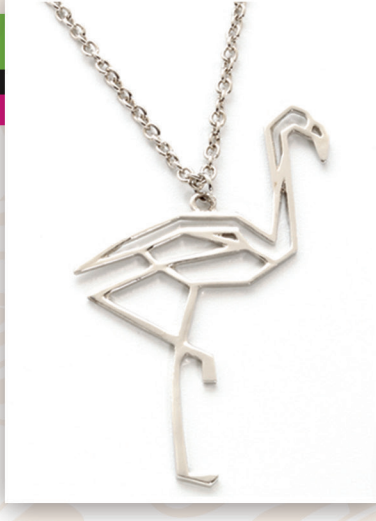
19039 Geo Pendant Necklace Flamingo