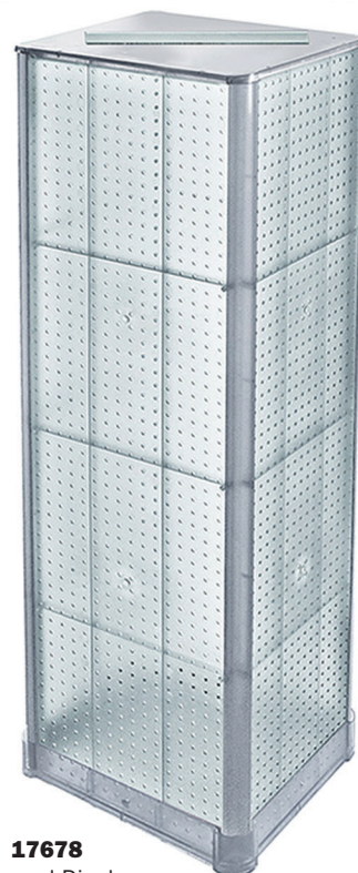
17678 Pegboard Display 4 Sided Clear 16"W x 60"H