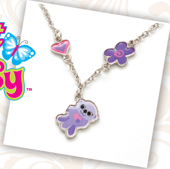
19639 Sweet & Sassy 3 Charm Necklace Sea Otter