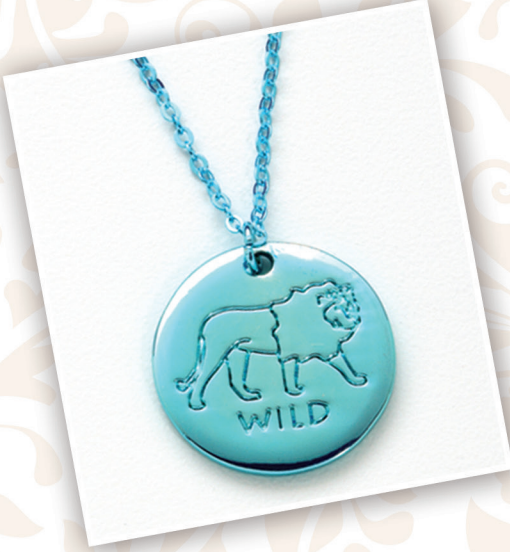
19046 Word Circle Necklace Wild