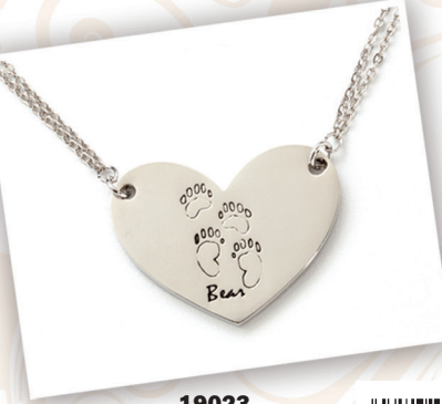
19023 Heart Footprint Necklace Bear