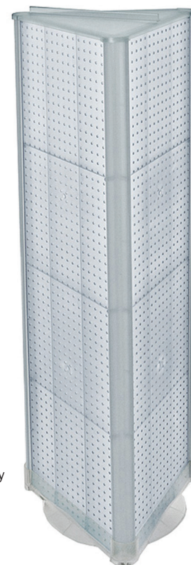
17681 Pegboard Display 3 Sided Clear 16"W x 60"H